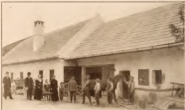
When the Immigrant comes home.